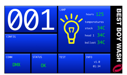
Sample Menu Screen

The Best Boy Wash luminaire features a builtin LCD touchscreen display which provides access to control, configuration, status, and testing functions.